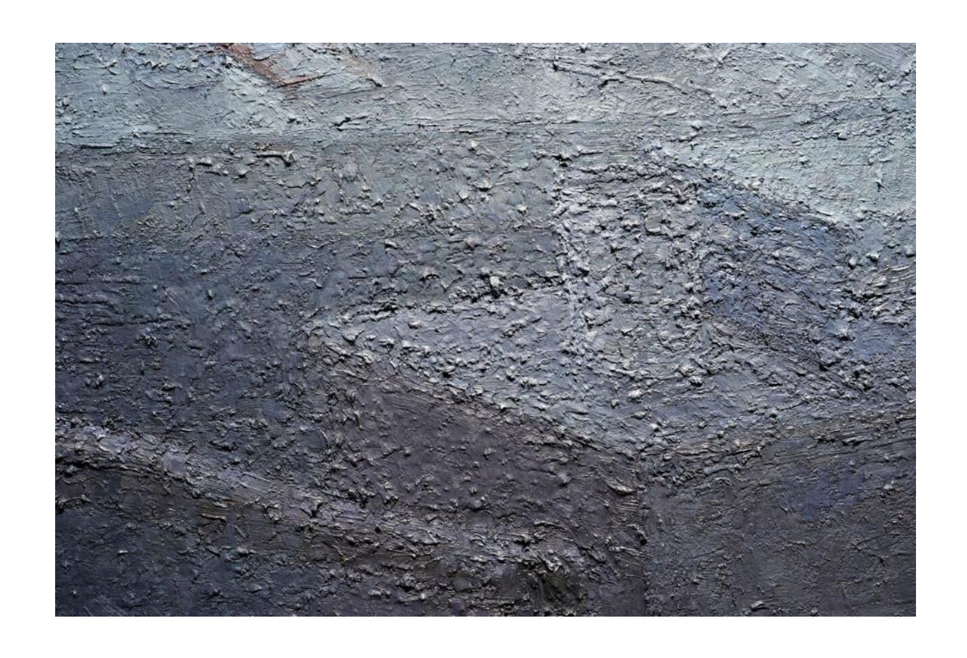
Morning Light (detail)