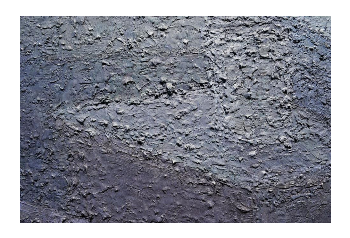
Morning Light (detail)