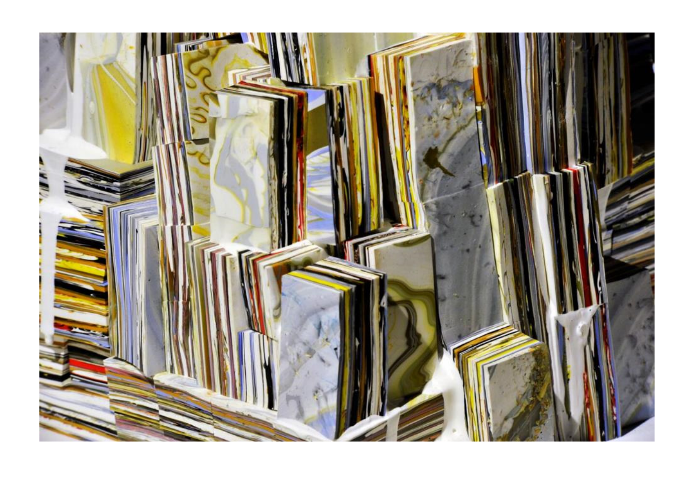
Block of Blocks with White Pour, Large (detail)