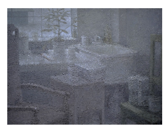
Eric Elliott (American, b. 1975)

Still life is traditionally defined as a work of art depicting inanimate, often commonplace objects that are either natural (fruit, flowers, etc.) or man-made (vases, glasses, books, etc.) in an artificial setting. As a demonstration of artistic skill and symbolic expression, still life has remained a popular art form for centuries. In the exhibition, Stilleven: Contemporary Still Life , you will find Northwest artists who choose the still life genre to explore formal issues and/or to create narratives and express ideas. You will also find artists whose work may challenge the genre's conventional definition, but share the same formal and expressive ideas found in traditional still life.