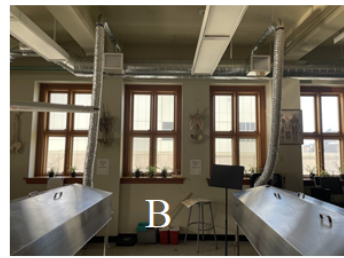
Figure 1: Plants (A. Chlorophytum comosum ) were placed at eyelevel (1 every 8.7 meters) around the perimeter of the cadaver laboratory. Two cadavers (B.) are located centrally in the room on down-drafted steel tables.