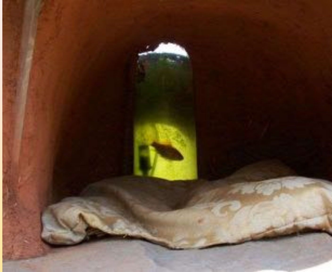
Cat Hotel with cat TV