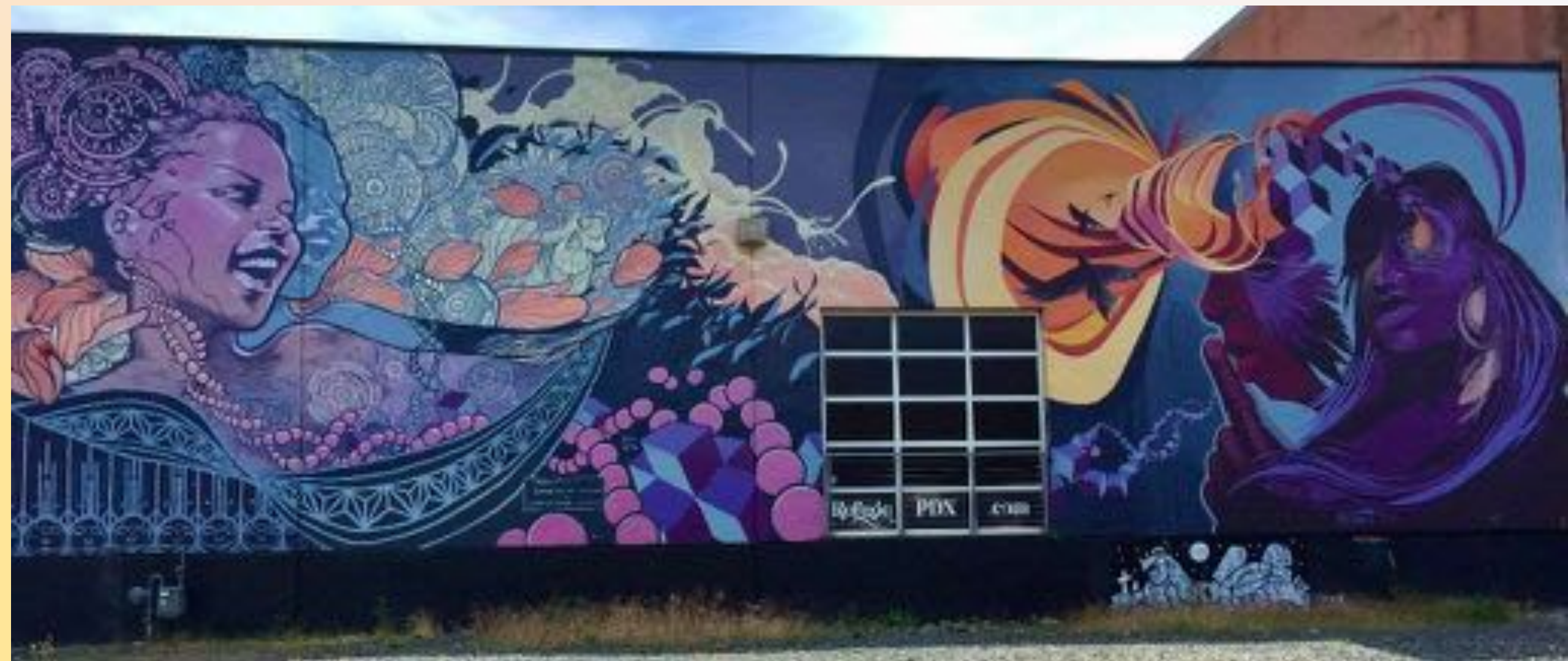
Ashley Montague 116 SE Yamhill