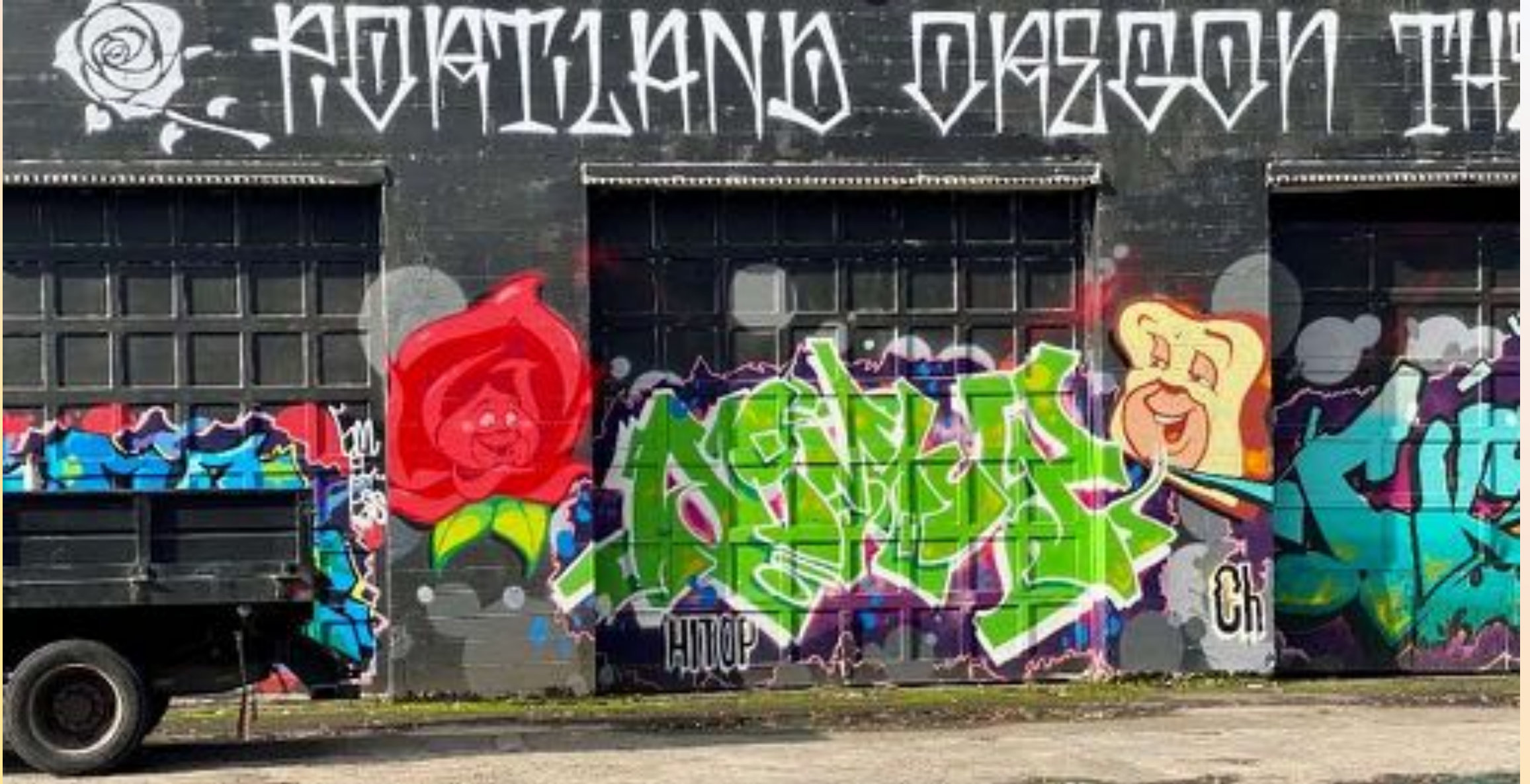
Bread and Roses on NE Oregon Steel Street and Interstate Ave. Murals on all 4 sides. Next two slides are from the same area.