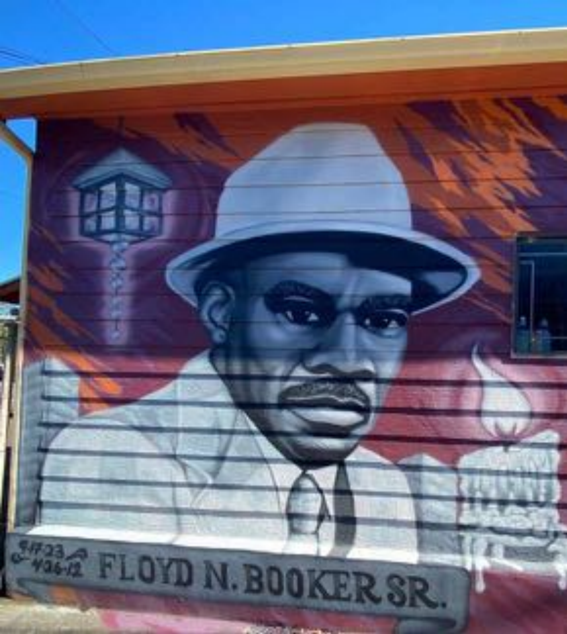
NE 17 th and Alberta