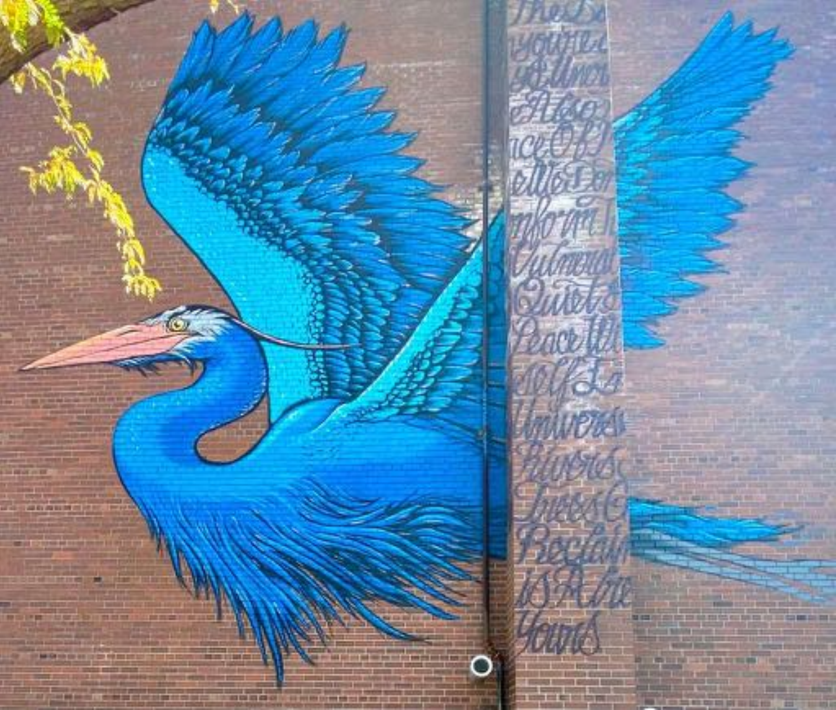
Jesse Hazeslip on Portland Community College Cascade grounds at 5700 N Kerby.