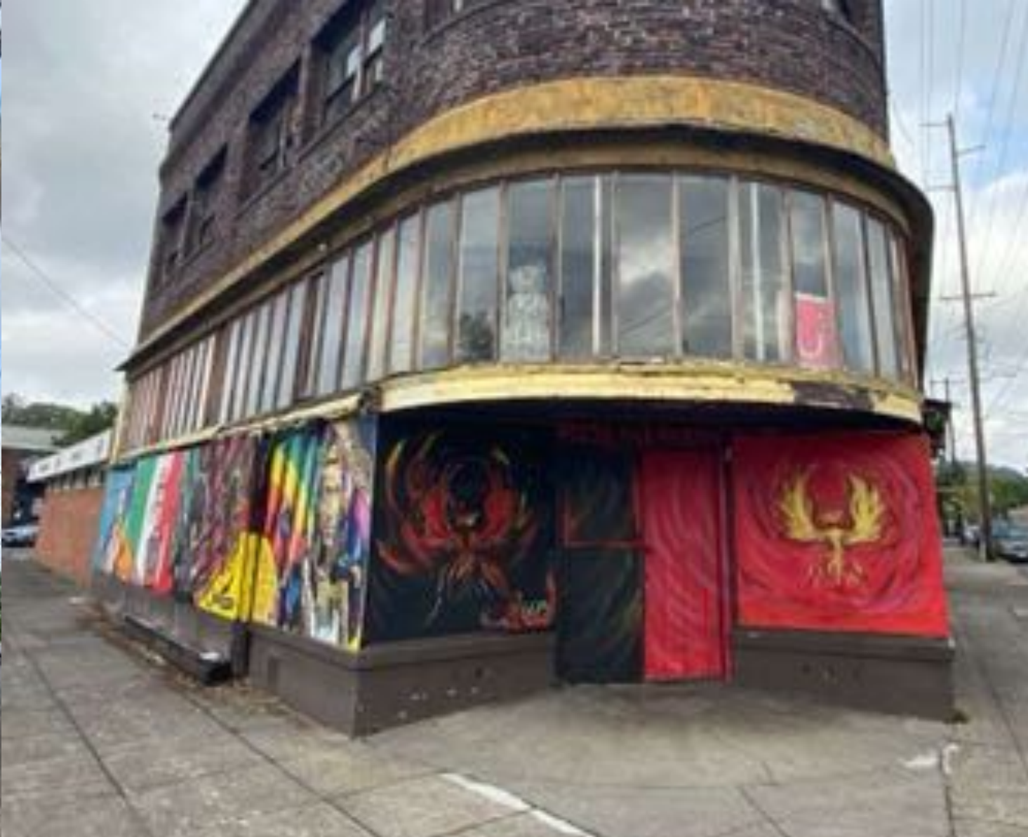
SE Foster 67 th Old Foster Pharmacy Building Art by Firekatg