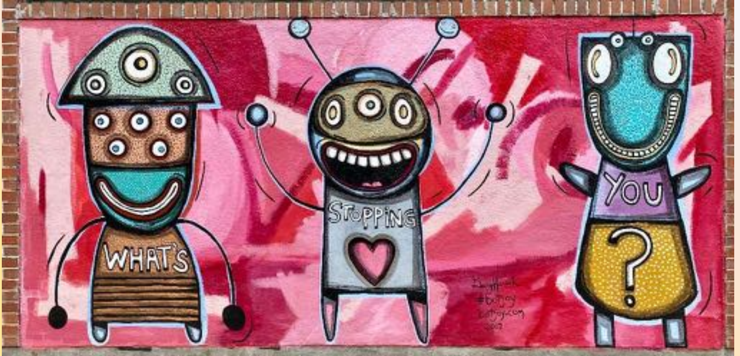
On SE Lincoln St. at 50 th Ave on Instagram #botjoy