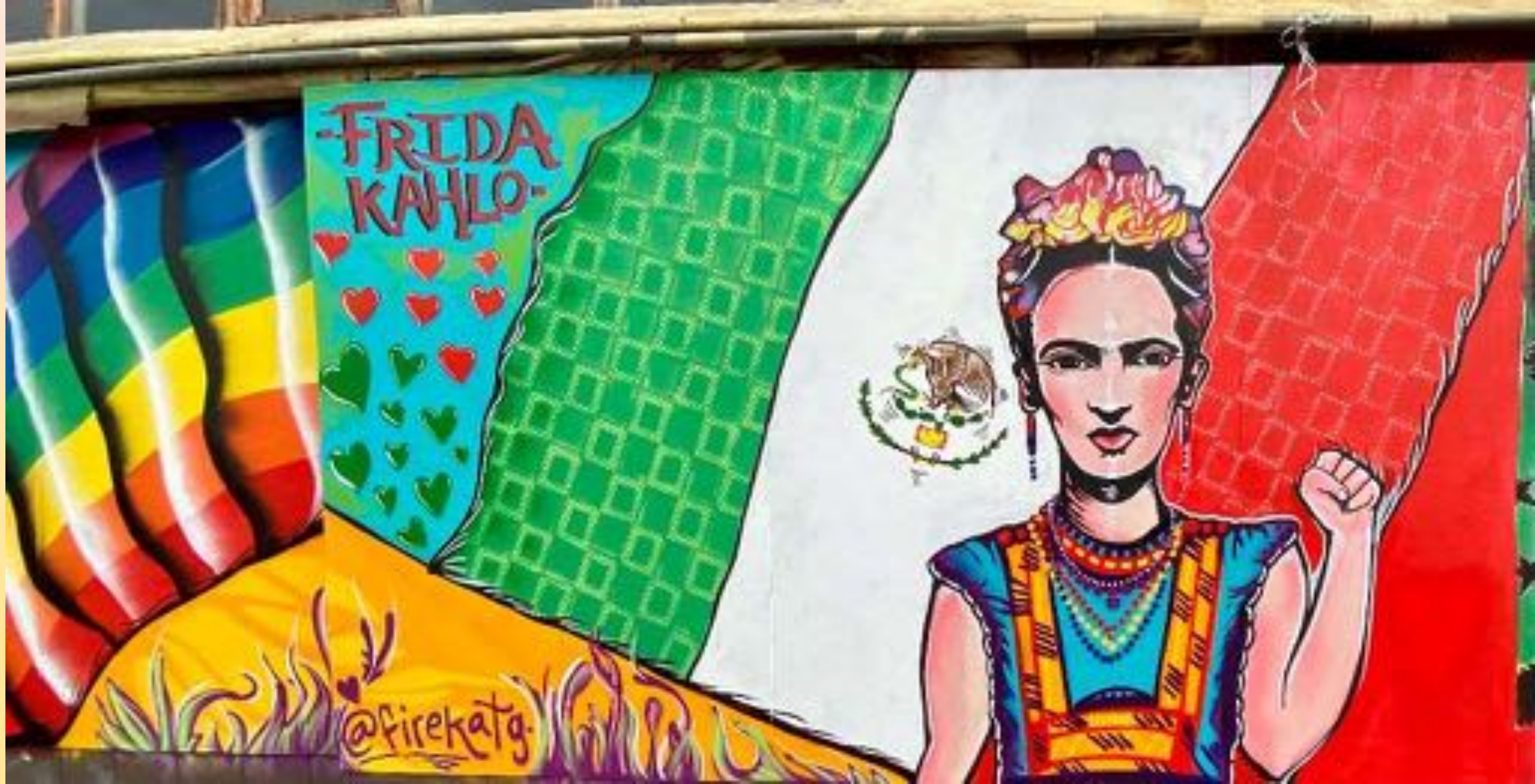
On the Old Foster Pharmacy Bldg