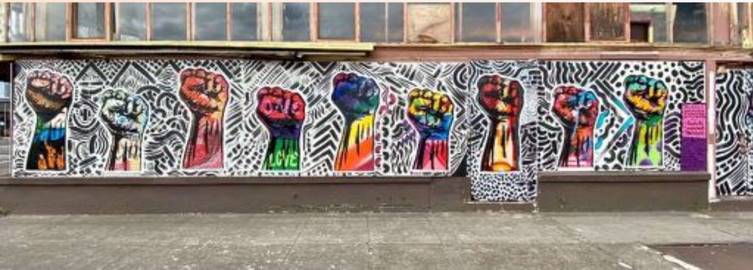
On the Old Foster Pharmacy Bldg