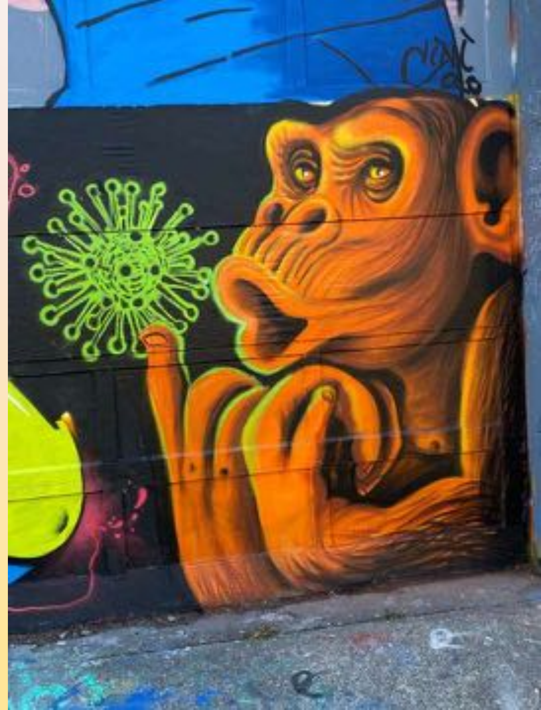
7600 SE Mitchell near Foster and 76 th