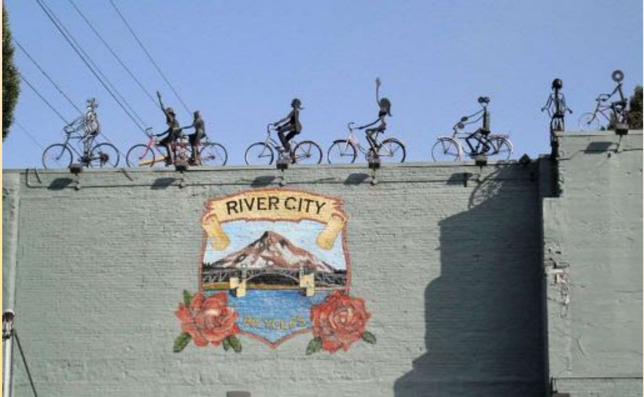
River City Bicycles 706 SE MLK