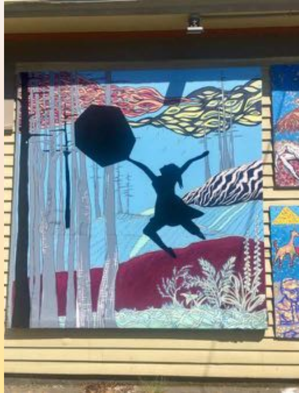
NE Alberta and 29 th