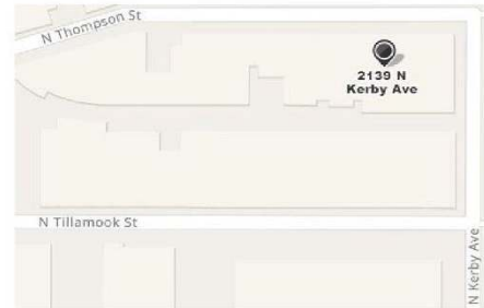
Glass Building 2139 N Kerby Ave