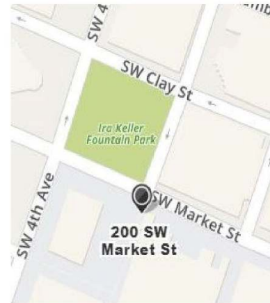
Atkinson MBA for Professional