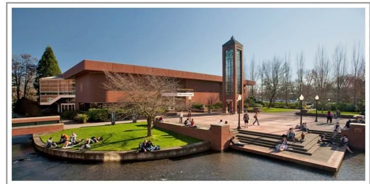
MARK O. HATFIELD LIBRARY

The teaching/learning program would be administered by elected member officers. This would be a self-run program where all members would participate in researching, presenting lectures, and participating in discussions on a wide variety of topics organized by a curriculum committee. University faculty and other experts would be invited to do presentations as well.