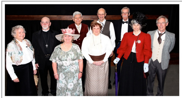
THE 2012 ICL PLAYERS