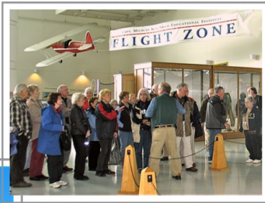
EVERGREEN AVIATION MUSEUM FIELD TRIP 2011

A field trip is a highlight of each semester as is the dramatic presentation by the ICL Players.