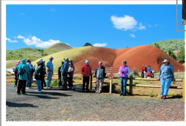
EASTERN OREGON FIELD TRIP 2010