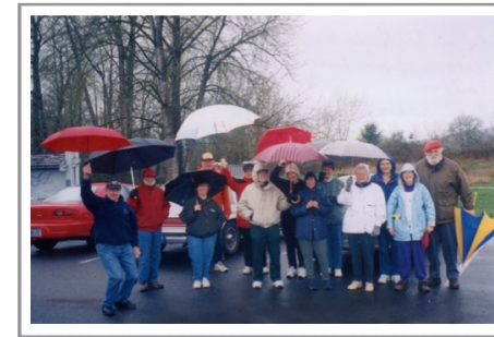
FRIDAY MORNING WALKING GROUP

ICL has enhanced the social lives of its members, led to lasting friendships, and over the years, several extracurricular special interest groups have evolved.