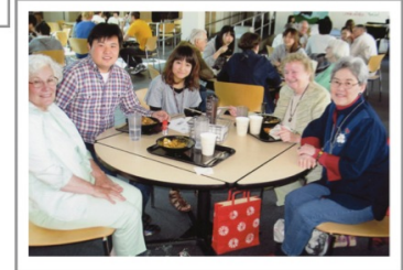
LUNCH WITH TIUA STUDENTS

ICL members are willing promoters of students and their various projects.