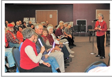
ICL TALENT DAY 2010