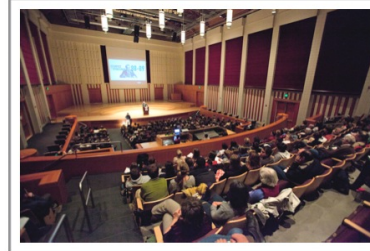
HUDSON HALL EVENT

ICL members enjoy many social activities. These activities not only benefit ICL but also Willamette University, since ICL members regularly support and attend campus activities such as concerts, recitals, sports events, theater presentations, and lectures.