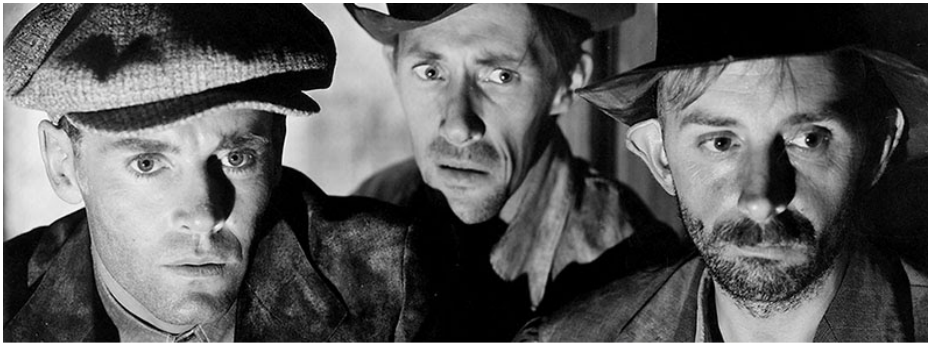
Scene from The Grapes of Wrath , 1940

Enjoy the break and Happy Holidays! (pandemic-style)