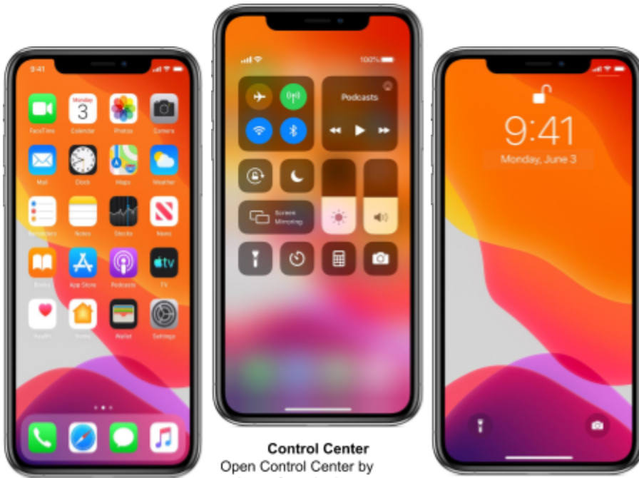
Home screen From your Home screen, tap the Camera app.