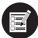
Test Prep Courses

We help students succeed in high school and beyond by giving them resources for better grades, better test scores and stronger college applications. Our proven methodology gives you test-taking strategies and a guaranteed better score.* With a range of options, including one-on-one private tutoring, semi-private and traditional classes, and online prep, The Princeton Review offers the flexibility to fit your schedule and learning style.