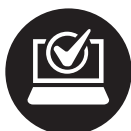
On-Demand Homework Help